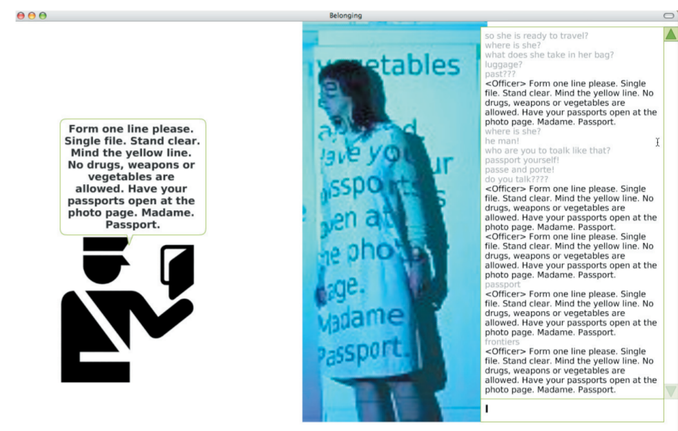
Belonging by Avatar Body Collision, 2007

What was most engaging about the cyberformance experience was the sense of the performances forming in the very moment of the encounter, and the sense that spectators participated in this encounter.