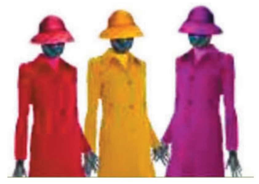
Come & Go by Samuel Beckett, performed by Avatar Body Collision in UpStage 070707 UpStage Festival, 2007

UpStage V2 was released in 2007, thanks to a grant from the Community Partnership Fund of the New Zealand government's Digital Strategy. Students at Auckland University of Technology continue to develop the software along with volunteer open source programmers, and annual festivals feature performances by many artists.